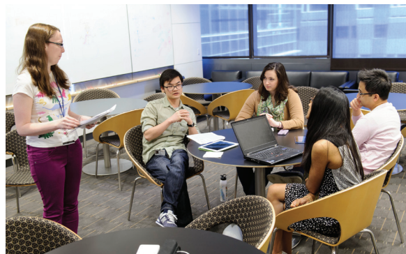
GSK students in Journal Club

We are located on the Upper East Side of Manhattan, in an active community of graduate students, postdocs, medical students, and clinical fellows. MSK also has partnerships with Weill Cornell Medical College and The Rockefeller University and offers several joint graduate training programs.